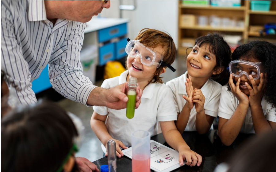
Photo is for illustrative purposes only. Any person depicted in the photo is a model.