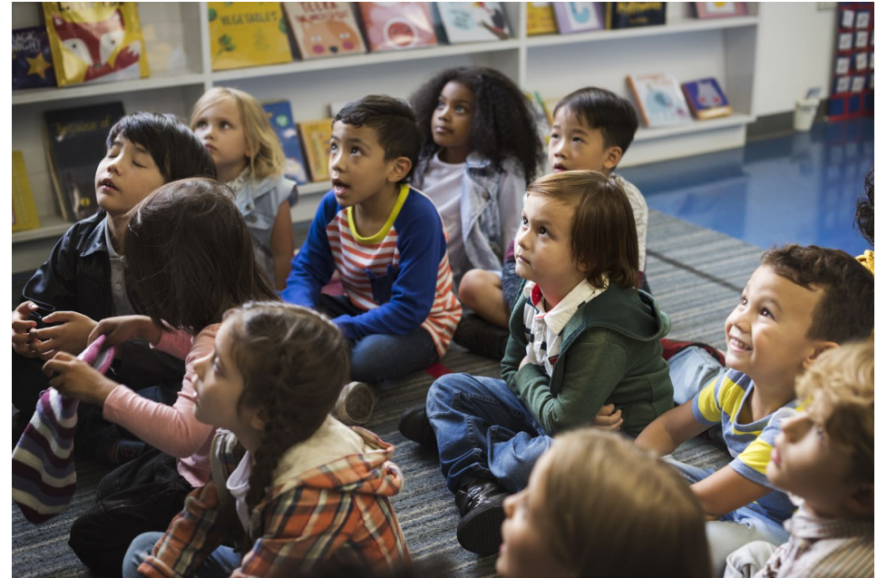
Photo is for illustrative purposes only. Any person depicted in the photo is a model.