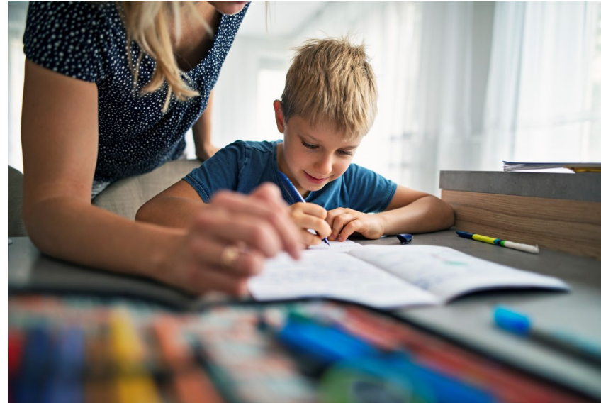
Photo is for illustrative purposes only. Any person depicted in the photo is a model.