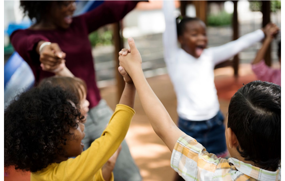
Photo is for illustrative purposes only. Any person depicted in the photo is a model.