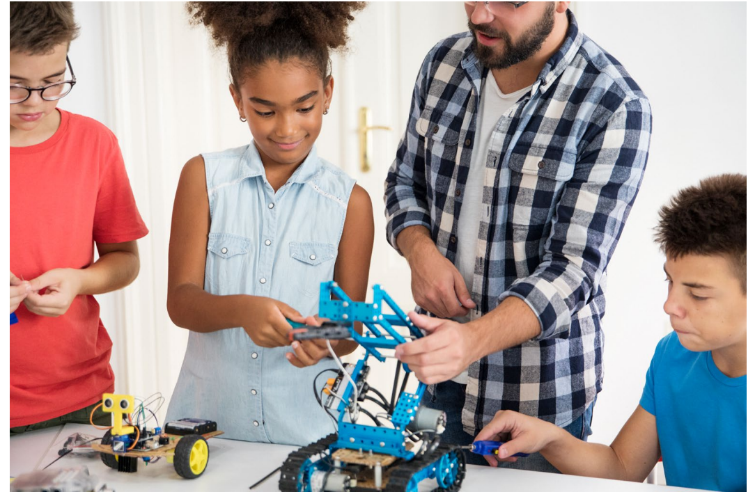
Photo is for illustrative purposes only. Any person depicted in the photo is a model.

Share in the chat! What other role(s) does summer programming play in your school community?