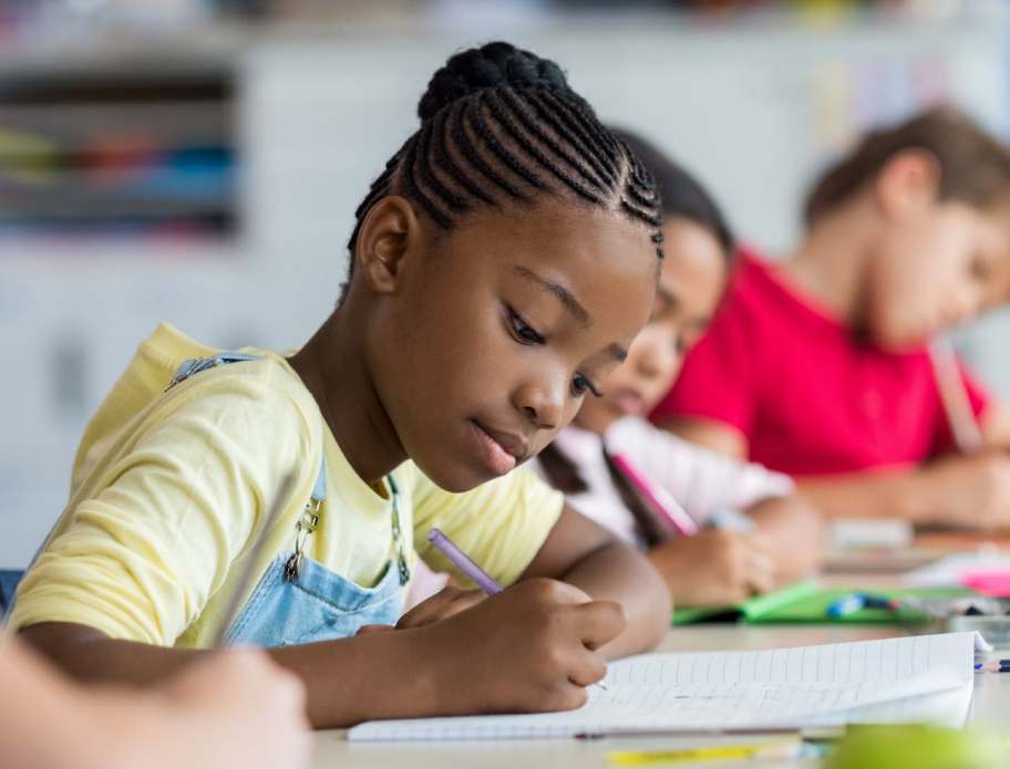
Photo is for illustrative purposes only. Any person depicted in the photo is a model.